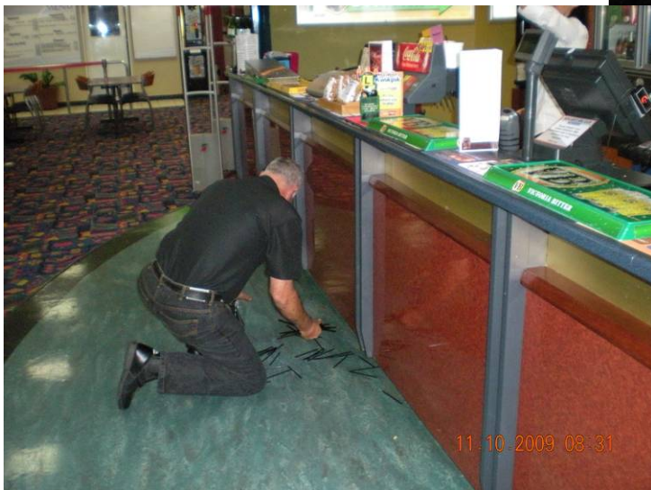
Well that's it for the 2009 run. From what I have heard a good time was had by all. Will be with you in 2010.