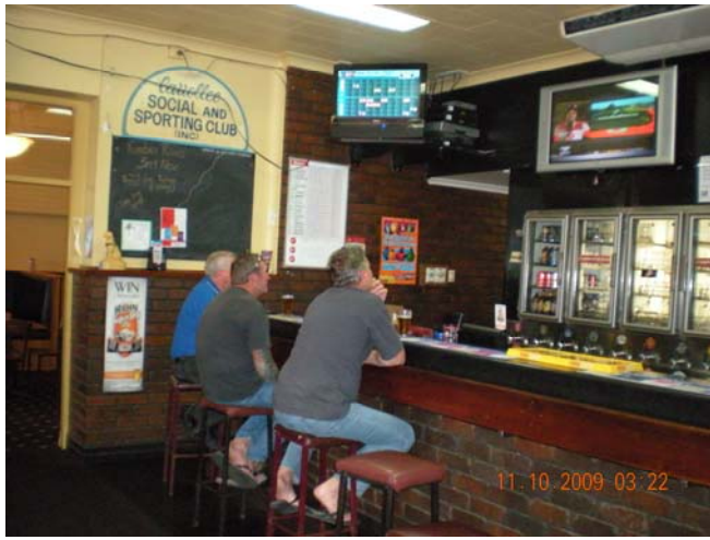
Looks like Sunday, and the big race.