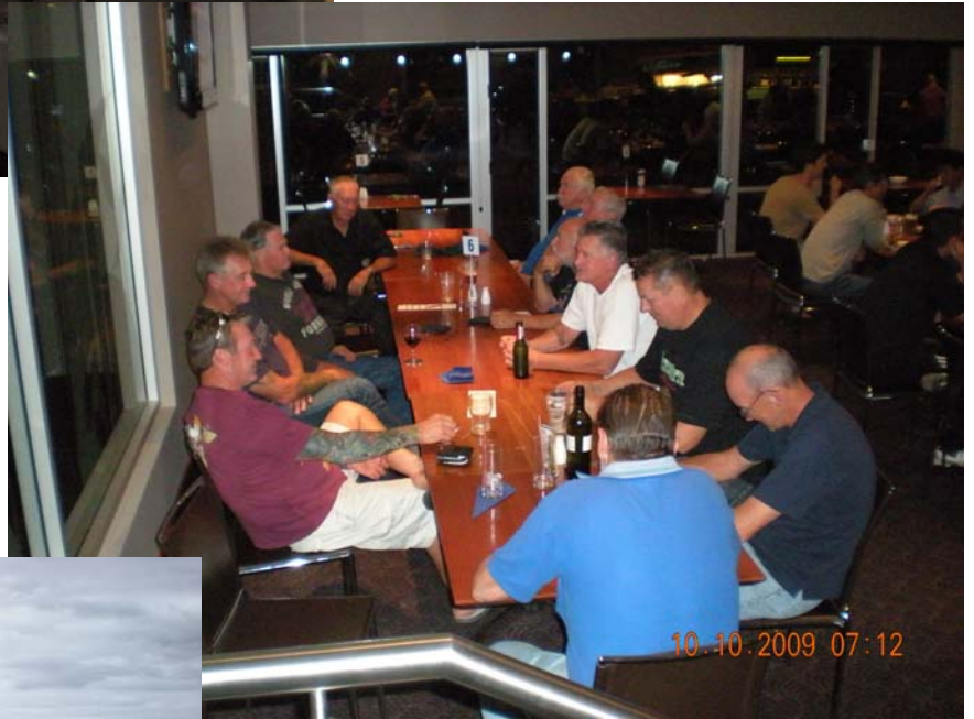
Another evening with everyone deep in thought.