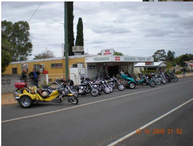
Looks like everyone is ready to Rock'N'Roll