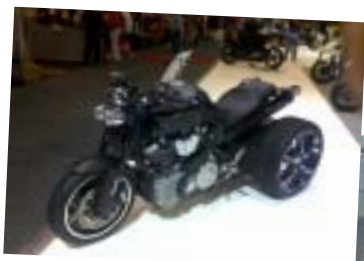
George, you look GREAT!

3 Short easy ride; an easy day. Suitable for everyone.