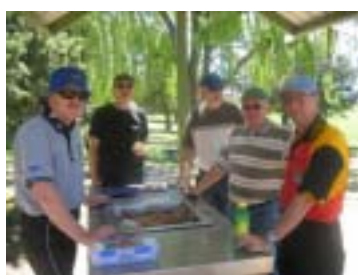
Nice snags boys...