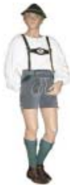
What IS he doing with his left hand?