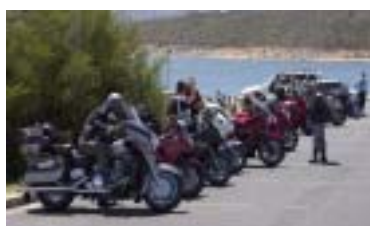
Check out the beautiful lake...