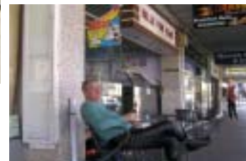
must get back to the gym when we get home.

Repacking our bikes doesn't take long and we are soon on the road again.