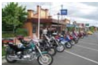
Just look at that lovely 750 Virago!

With the weather predicted to be awful, it was with trepidation that I peered out of the bedroom window, dressed in a gorgeous negligee (some would cruelly call it a nightie) of pale baby pink polyester - a vision of loveliness if I say so myself. It was cloudy and windy and not terribly inspiring. As arranged the previous evening, I picked up the phone to see what another brave Ulyssean thought of the weather. She thought we should go, so I rang another brave soul to confirm our stupidity. After much deliberation we all decided that we would brave the weather and