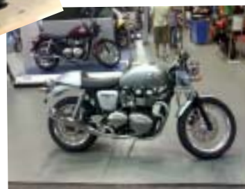
Photos from the Sydney Bike Show