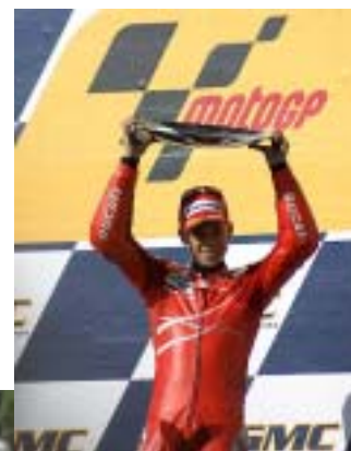
It appears that Mick Doohan has thrown Kim over for a newer model...

S1 $4,281.60 S2 $2,762.81 Investment $5,000.00