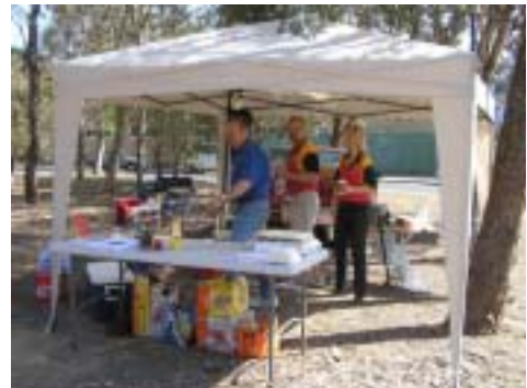
Our wonderful BBQ team at it again - this time at the new CMC in Mitchell