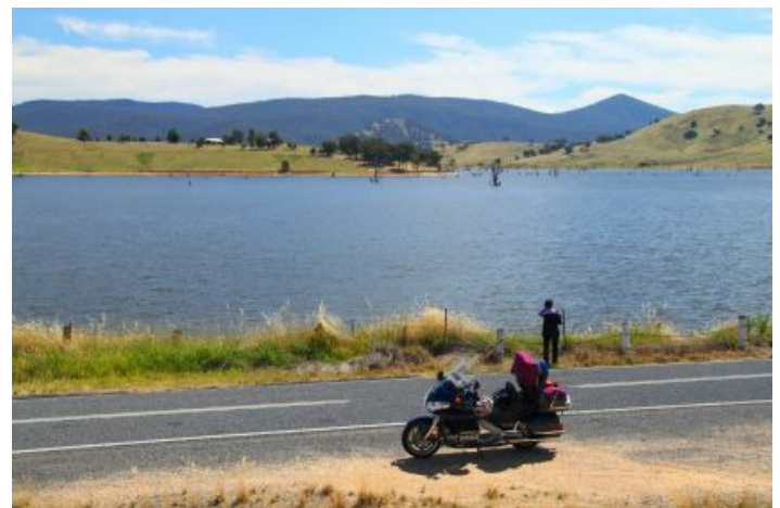
Sally and the Gold Wing beside Lake Hume

We turned off at South Gundagai and took one of our favourite roads through Tumut and Batlow to Tumbarumba for lunch at the 4 Bears Café (recommended – great burgers!). From there we headed south-west on a newly renovated road bursting with smooth sweeping bends to Jingellic, followed the south bank of the Murray River and full-as-a-tick Lake Hume to Wodonga (another great road) and tootled down the freeway to Wangaratta. We stayed in a cabin at the Big4 North Cedars and dined on juicy steaks at the historic Vine Hotel.