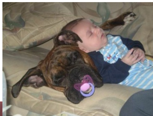
Why Kids need a Pet