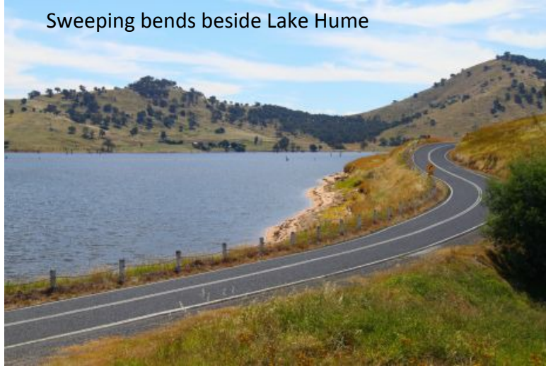
Sweeping bends beside Lake Hume

On day two the roads got even better. From Wangaratta, C521 (route numbers are the best way to navigate in Victoria if you don't have a GPS) took us up the beautiful King Valley to Whitfield and over the range to the cattle and ski town of Mansfield. The 63 kilometres from Whitfield to Mansfield is nothing short of awesome! Bend after bend, twist after twist, with big views over deep, steep gorges but nowhere to stop to take photos. Oddly, coming down the Mansfield side of the range every bend had a 45 km/hr advisory sign whether we took it at 40 or 80. We could only presume that the road workers had a truck full of left-over 45 km/hr signs and couldn't be bothered going back to the depot for any others.