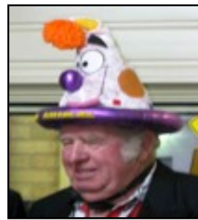
Member of the Month